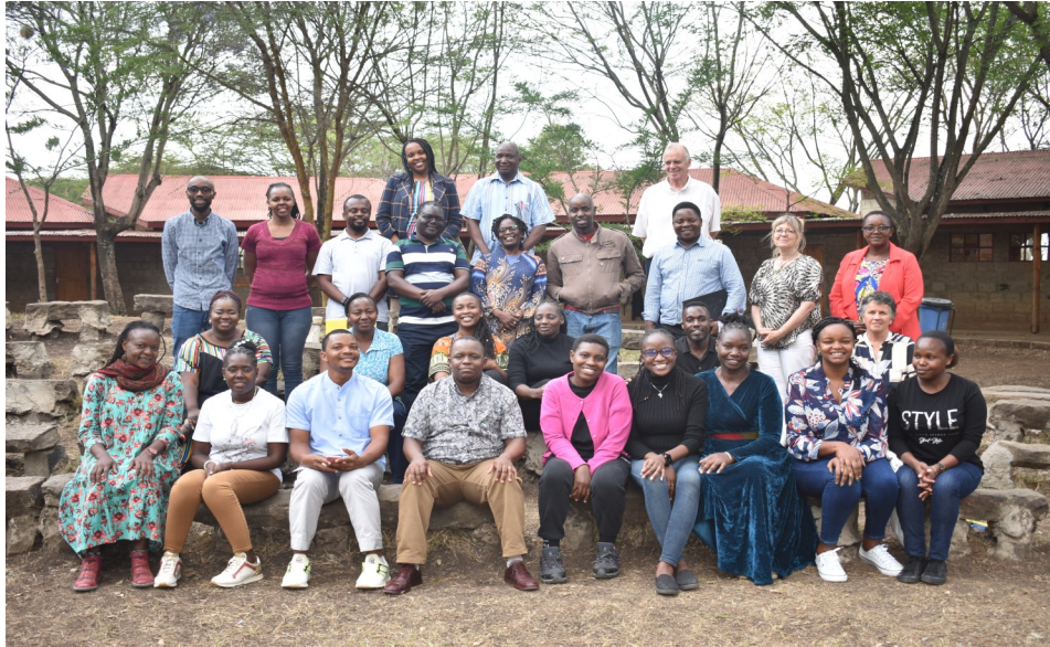
Leadership course participants October 2023